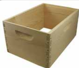
Ten Frame Hive Body $18.00 Ten Frame Supers $14.00

The book also contains a page of facts about honeybees, a glossary of terms, and recipes and activity pages for children courtesy of the National Honey Board.