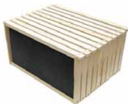
9 1/8" Frames ONLY $1.25 Each Foundations Starting $1.00 Each