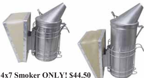
4x7 Smoker ONLY! $44.50 4x10 Smoker $48.75